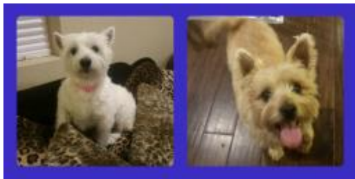
Deja &amp; Cocoa

Hi all I am Deja a 12 year old Westie girl. I have a Cairn brother, Cocoa that is 7 years old. We are very close and even like to sleep in the same bed. Our first owner died and so we were brought to Rescue. My brother got a foxtail in his foot and needed surgery shortly after we arrived at our foster home. We now have a wonderful home and other canine siblings to play with. We love our new Mom.