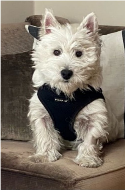
Jake has been adopted