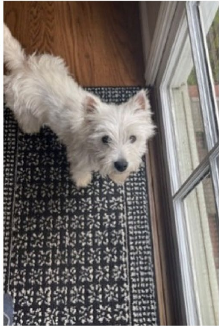
Pippa has been adopted